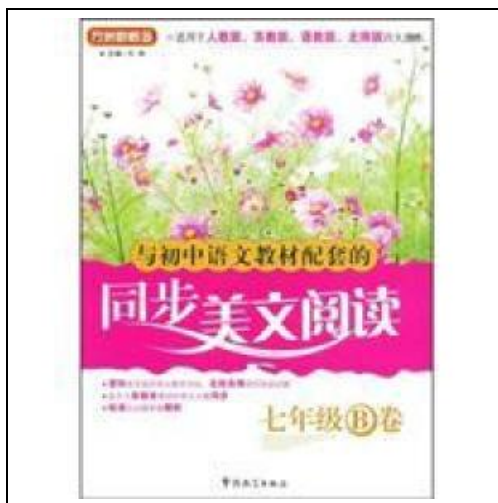
Filesize: 5.26 MB