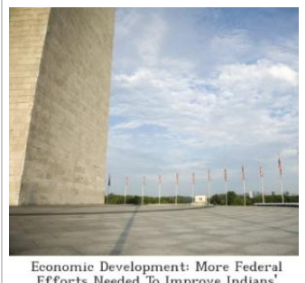
Economic Development: More Federal Efforts Needed To Improve Indians' Standard of Living Through Business Development: CED-78-50

U.S. Government Accountability Office (GAO)