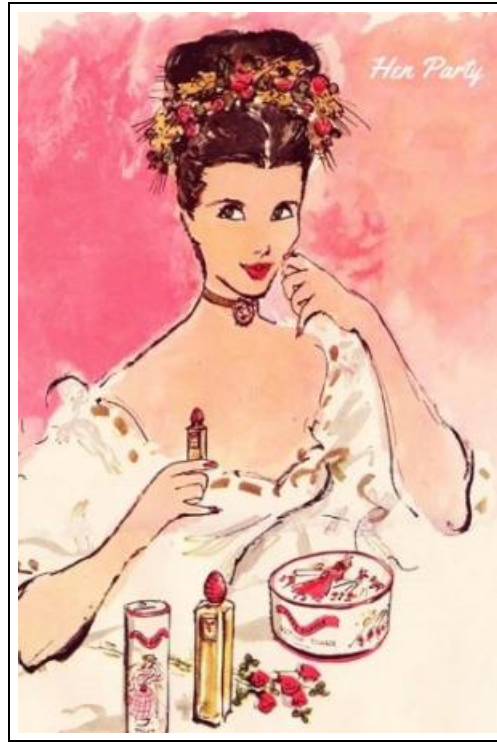
Filesize: 2.89 MB