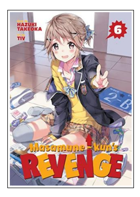
Filesize: 2 MB