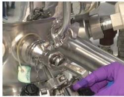
Building Bioinformatics Solutions Robert Elder