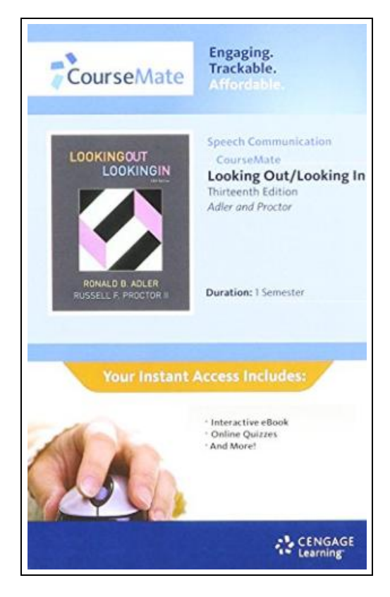
Filesize: 4.12 MB