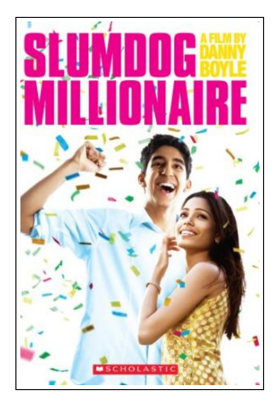
Filesize: 4.47 MB