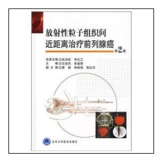
Filesize: 9.73 MB