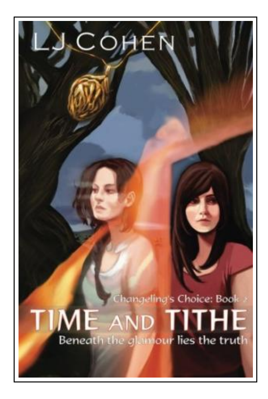
Filesize: 8.11 MB