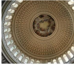
Projections of Education Statistics to 2020