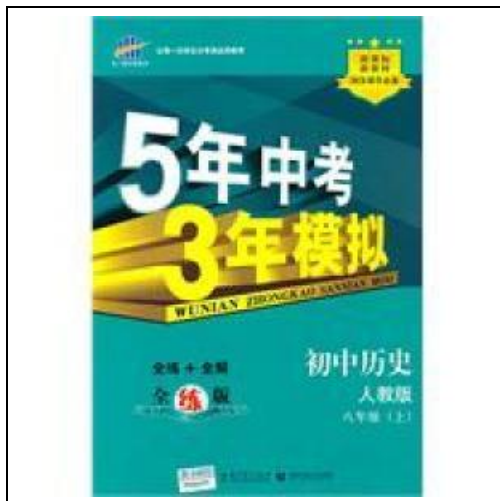
Filesize: 2.15 MB