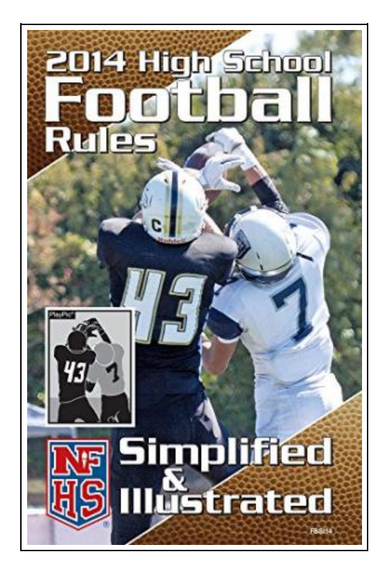
Filesize: 6.73 MB