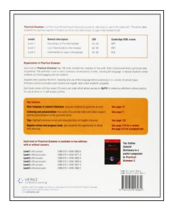
Filesize: 6.73 MB