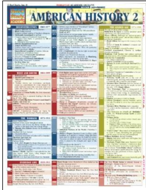
Filesize: 4.09 MB