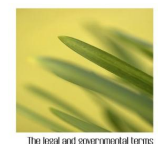
The legal and governmental terms common to the Macedonian Greek inscriptions and the New Testament, with a complete index of the Macedonian inscriptions ..