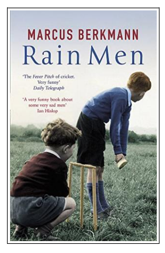
Filesize: 6.12 MB