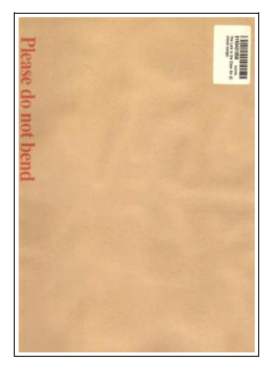
Filesize: 6.8 MB