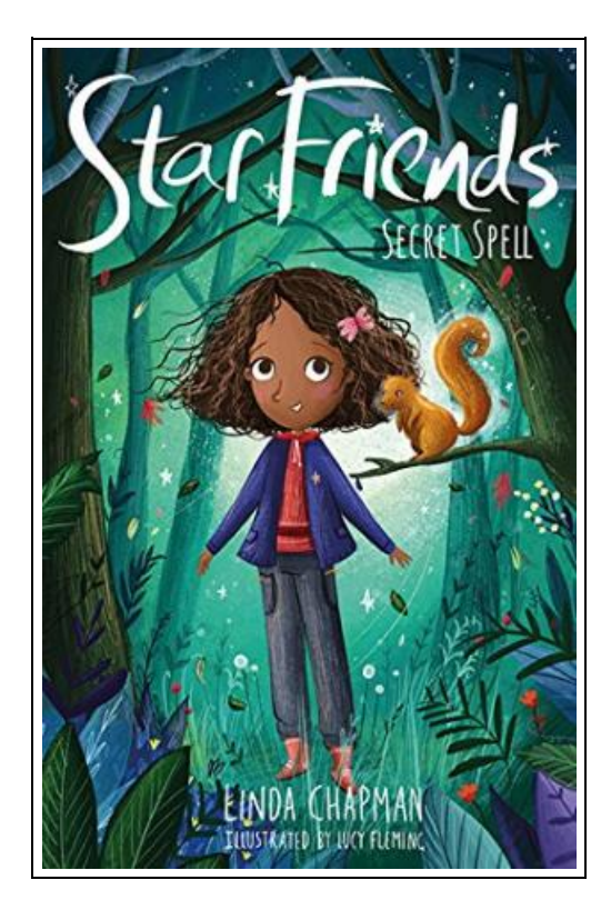
Filesize: 2.33 MB