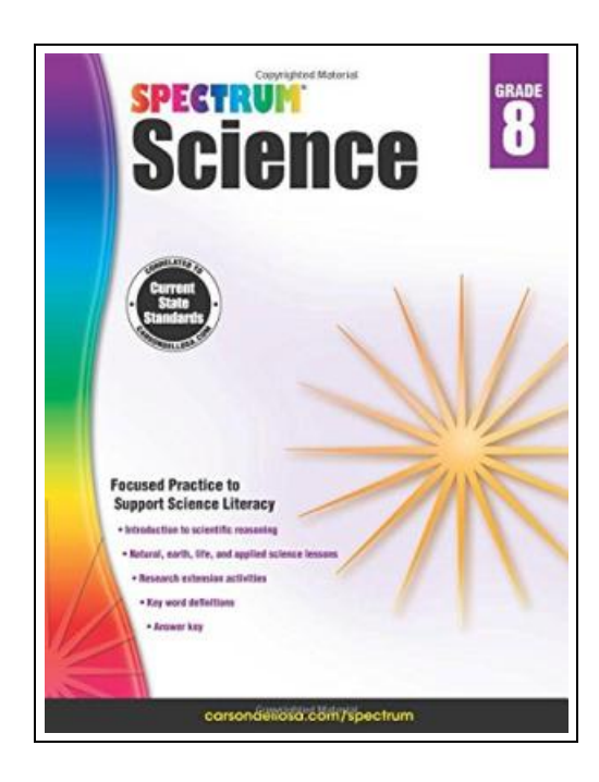
Filesize: 2.54 MB