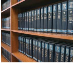
IN TRANSIT, VOLUME 11, ISSUE 10...