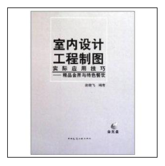
Filesize: 8 MB