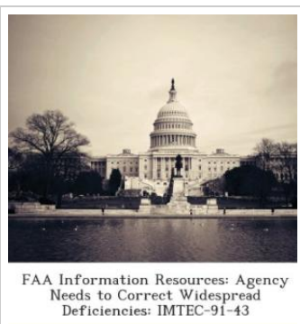
U.S. Government Accountability Office (GAO)