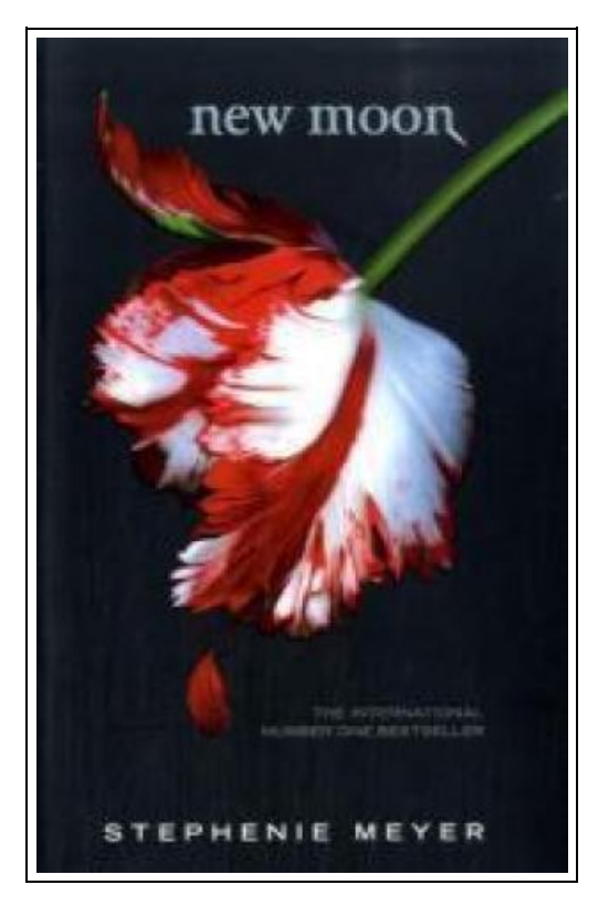
Filesize: 5.31 MB